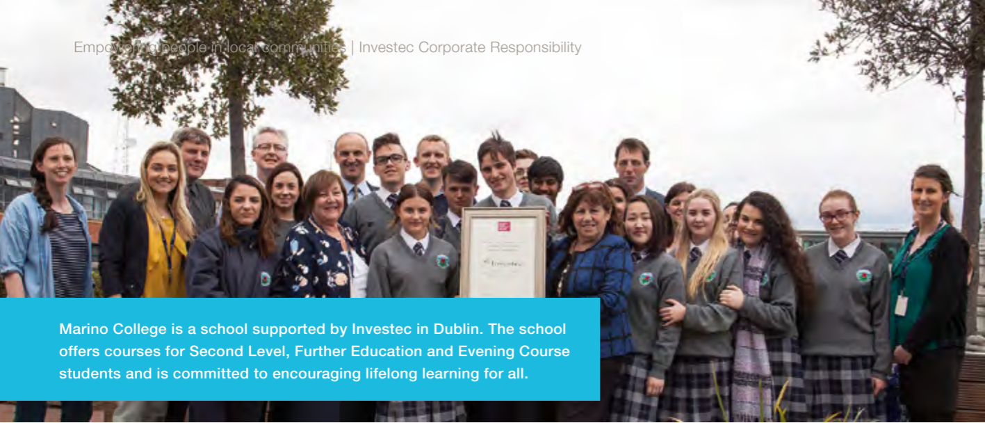
Marino College is a school supported by Investec in Dublin. The school offers courses for Second Level, Further Education and Evening Course students and is committed to encouraging lifelong learning for all.